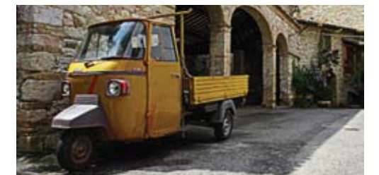
Romantic little villages in Umbria