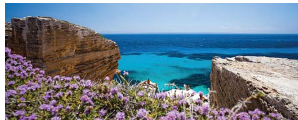
Beautiful Sicily. Also a Vespa destination.