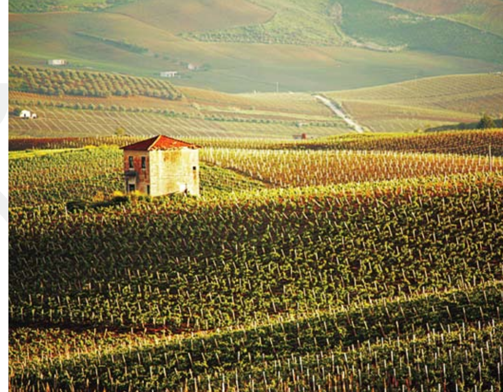
The green heart of Italy.

Starting in Umbria or wherever you'd like, you will discover one of the most beautiful, romantic and relaxing places in the world from the seat of the typical Italian vehicle (sorry FIAT), the Vespa scooter.